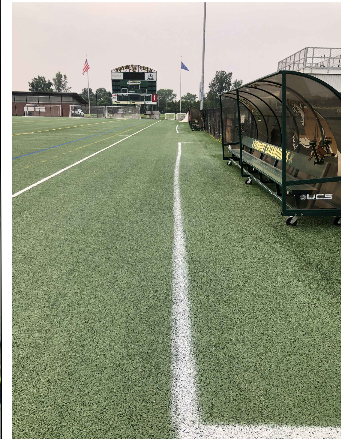
TYPICAL PAINTED LINE INSTALLATION