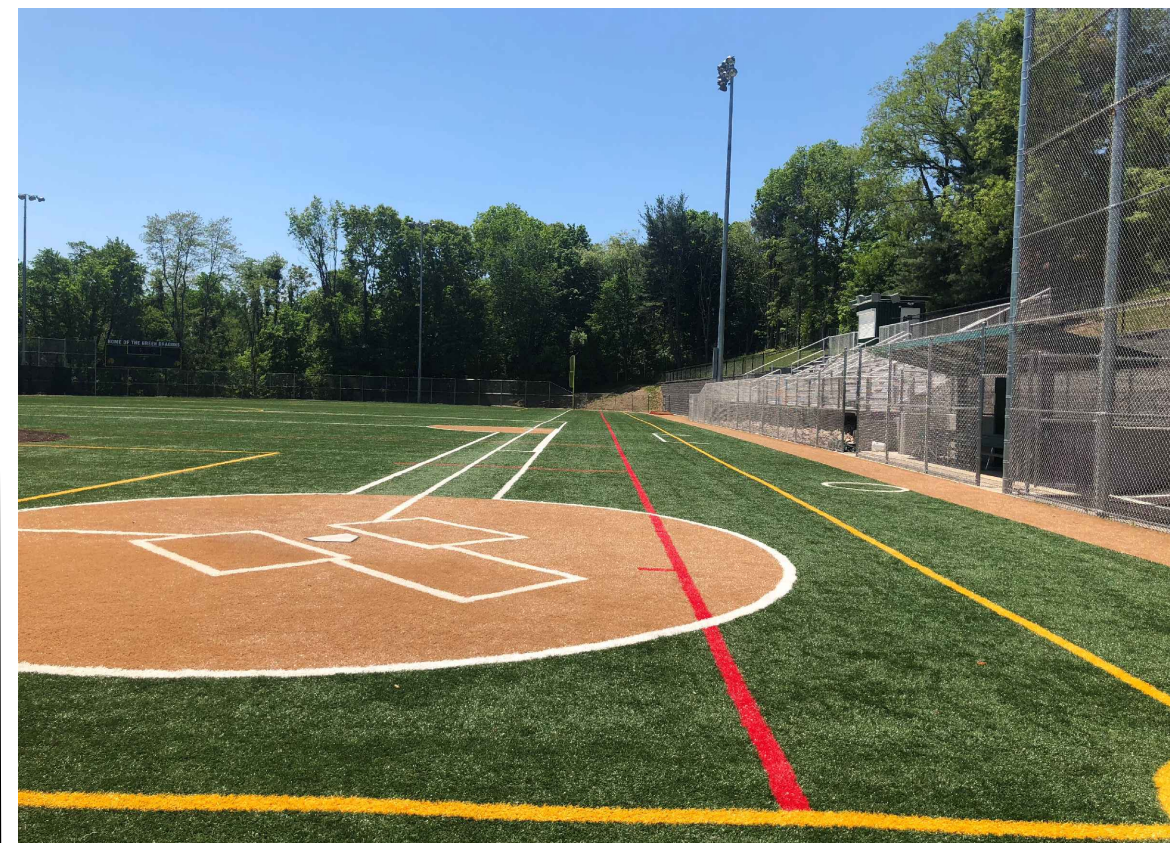
TYPICAL INLAID LINES NEAR BASEBALL HOME PLATE